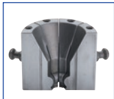
Custom Made Dies