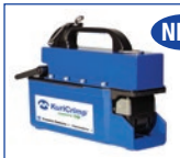
Battery Pump KC1-H64-BPP