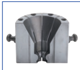
Custom Made Dies