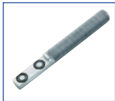
Die Segment Change Tool KCDCT-H39