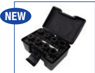
Case and Dies KC1-H47E-DIECASE