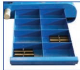
Die Storage Drawer