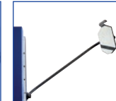
Back Mirror MIRROR-H144