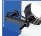
Back Limit Switch