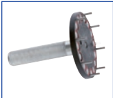
Quick Change Die Tool KCQCT-H119