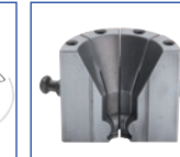
Custom Made Dies