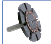
Production Quick Change Die Tool KCPQCT-H135