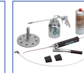
Cleaning and Lubrication Kit CALKIT-H144