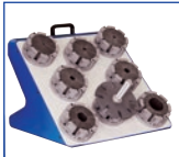
Die Rack (8 pc.) DIERACK-H119