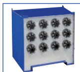
Die Holder Base (12 pc.) DIEBASE-H69