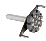
Production Quick Change Die Tool KCPQCT-H69