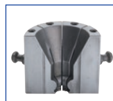
Custom Made Dies