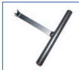
Die Segment Change Tool