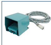
Electric Foot Pedal PEDAL-ES