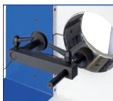
Back Limit Switch