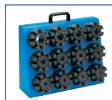
Die Rack (12 pc.) DIERACK-H69