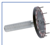
Quick Change Die Tool KCQCT-H69