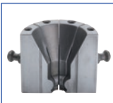
Custom Made Dies