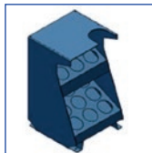
Die Rack DIEBASE-J67

Alternate Die Type Pusher Plate PUSHPLATE-J67T (Inquire for details)